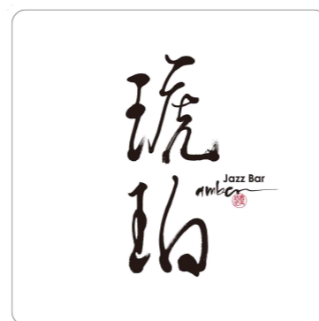
LD&K グループ jazzbar 琥珀 amber ロゴデザイン